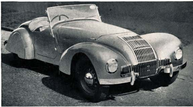
SPORTS TWO SEATER