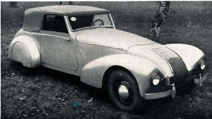
DROP HEAD COUPÉ