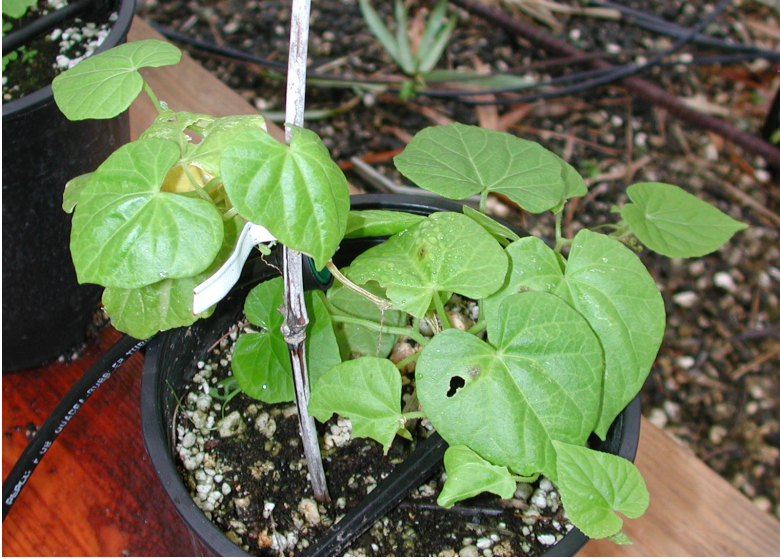
Zehneria plant in pot under cultivation.