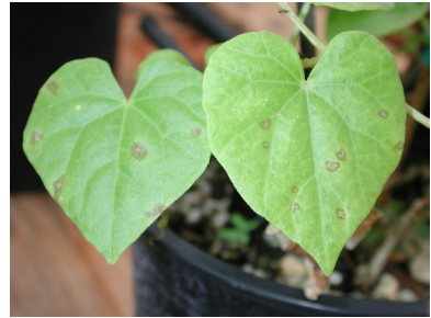
Leaf closeup with foliar disease

SCIENTIFIC NAME: Zehneria guamensis (Merr.) Fosberg