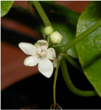
Female flower closeup