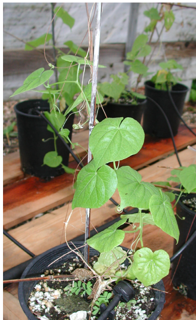
Zehneria is a viny plant climbing up a post