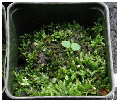
Emergence of two cotyledons of a seedling

FORM: A slender glabrous climber or creeper, monoecious