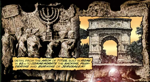
DETAIL FROM THE ARCH OF TITUS , BUILT IN ROME IN 82 AD TO COMMEMORATE THE SACKING, PLUNDERING AND BURNING OF JERUSALEM!