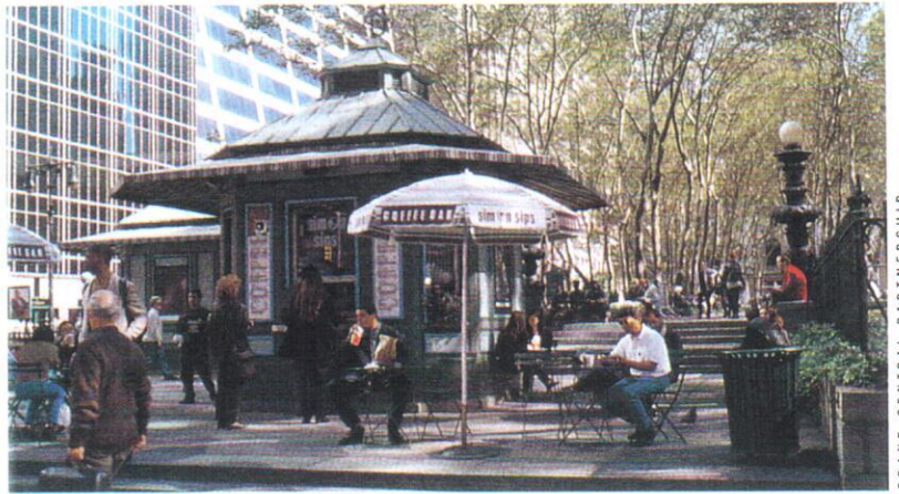
GRAND CENTRAL PARTNERSHIP

Bryant Park has become a popular gathering place and an attractive rental site for special events. Many parkside properties have been renovated. The rare aspect of Bryant Park's restoration is that a very well-researched design and management program was carried out to the letter, despite the involvement of at least a dozen public agencies and many private interests.