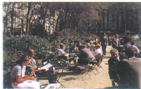
GRAND CENTRAL PARTNERSHIP

"Almost every step in the revival of midtown Manhattan's derelict Bryant Park was groundbreaking. A wisely planned and managed investment in open space has turned a disaster into an asset, dramatically improved the neighborhood, and pushed up office rents and occupancy rates."