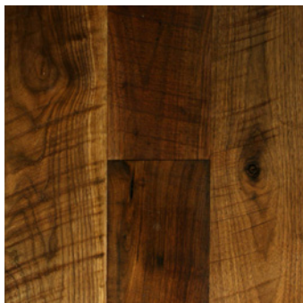
Oil-based Polyurethane On-Site Finish