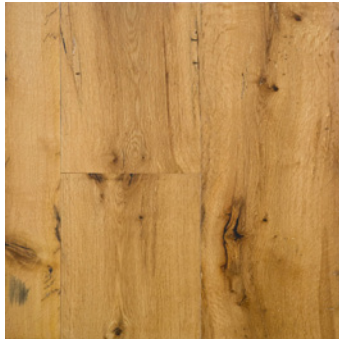
Water-based Polyurethane Pre-finish