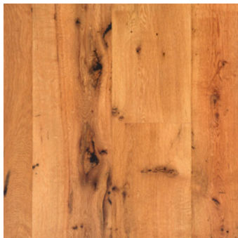
Natural Oil Pre-finish