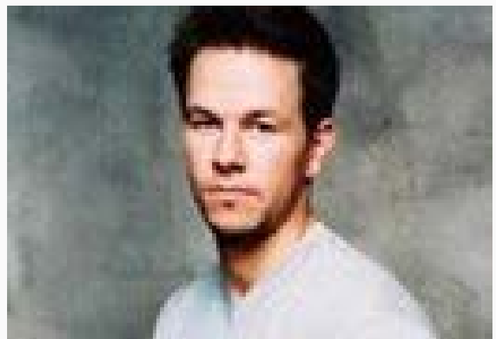
25 Celebrities Who Have Spent Time in Prison