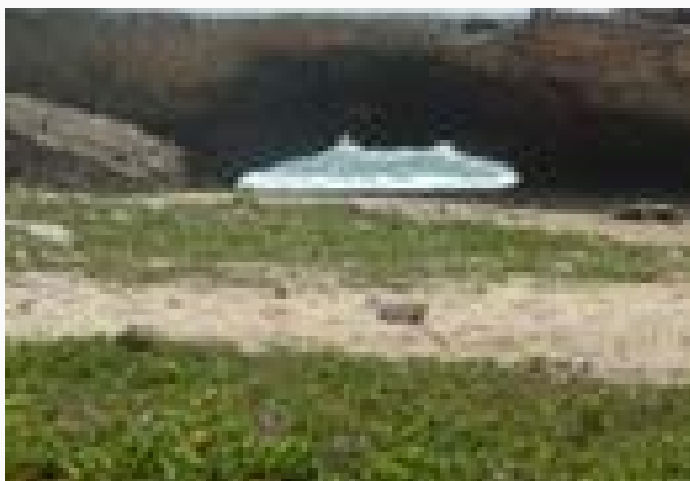
See Stunning Photos of Aruba's North Coast