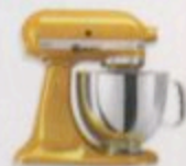
KitchenAid Artisan 5-quart 10-speed Stand Mixer STYLE KSM150PSYP