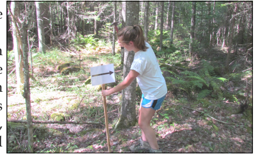
Working on the Meadow Brook Farm Trail.

My summer working alongside KLT staff and volunteers as an intern was a truly educational and motivating experience. Each person I met possessed a love for the environment and a desire to protect it for our use and the natural world's use, making each of those people an inspiration to me. From this experience I gained skills that I feel will be helpful in whatever career I eventually choose: skills like grant and press release writing, engaging with the public for educational purposes, and doing effective research. The very fact that my summer research project was on a topic I had absolutely no previous knowledge of (timber harvesting) had an unexpected bonus in that it allowed me to learn about an environmental issue that I hadn't considered before. I hope to bring what I learned from this experience to a state or national environmental organization next summer.