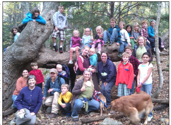
A group of Wayne families on a Sunday Pisgah hike.