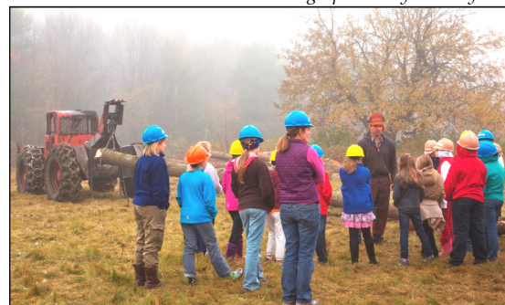
2012 Sustainable Forestry Days at Curtis Homestead.