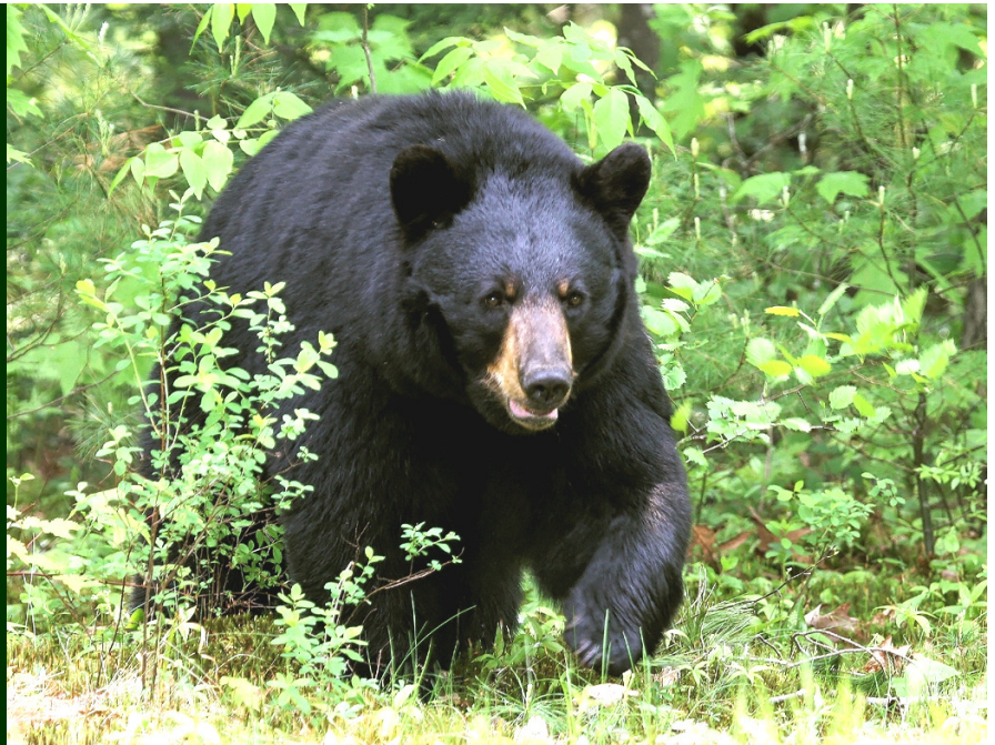
Female Black Bear