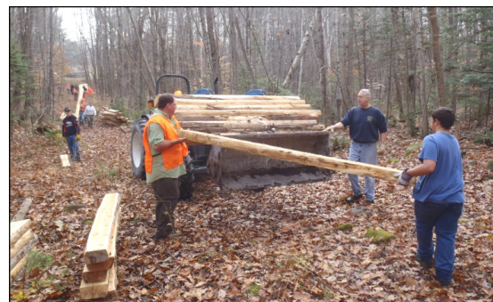
Gannett Woods volunteers.

Pond Conservation Area, significant progress has been made in planning a new trail on Mt. Pisgah, and new bog bridging was installed at Gannett Woods thanks to the Manchester Conservation Commission and the Maine Conservation Corps. Thanks to all who have helped maintain KLT's properties!