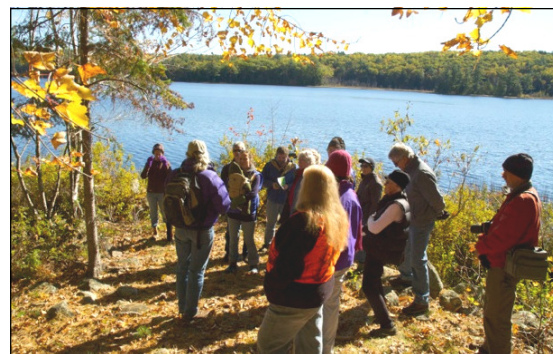
Hutchinson Hike, October 2012.

THANK YOU FOR YOUR ASSISTANCE WITH OUR OUTREACH, EDUCATION, LANDS, LYCEUM, AND STEWARDSHIP PROGRAMS