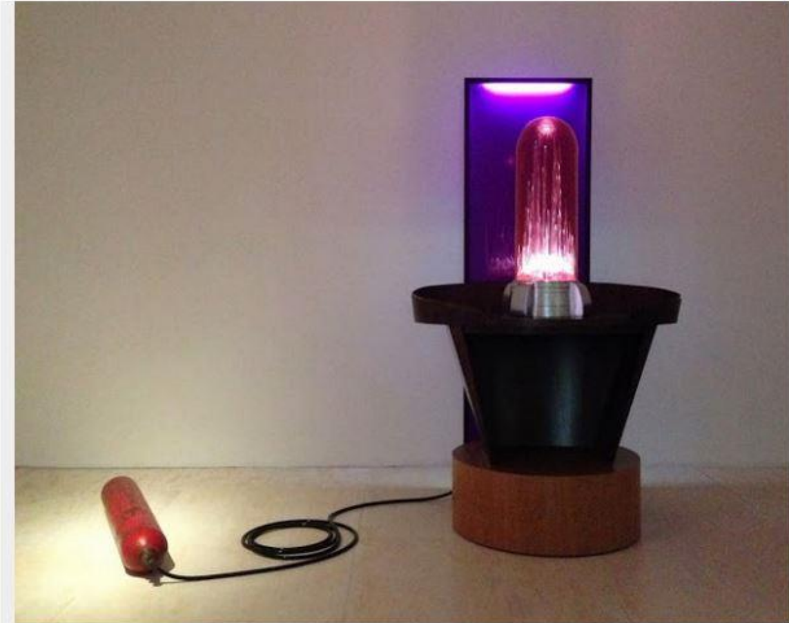
Installation view of Mike Kelley at MoMA PS1.

When George Washington crossed the Delaware, I imagine he turned to his troops and bravely announced, "Woot! We are the best." In art, success doesn't announce itself so easily; that's why critics end up in a huff toward the end of the year, trying to sort out the "great" from the mere "good." I've never been able to come up with a top ten list of exhibitions; big, lasting ideas don't always take place in art on the wall. So keep that in mind with my best-of list; there're exhibitions, sure, but my main requirement was picking "art" that I keep coming back to time-and-time again.