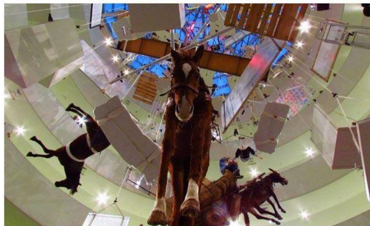
Not a hit with the critics: Maurizio Cattelan's dangling bits at the Guggenheim.

It's that time again! Stuffed into the informational crevices between the