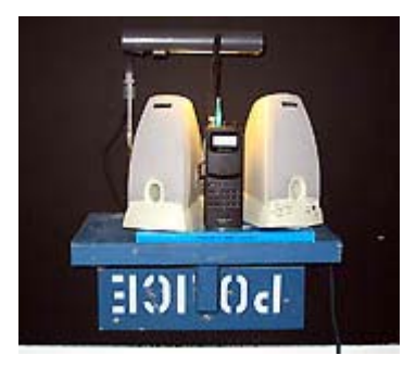
Tom Sachs' Applied Cultural Prosthetics at Cooper Union