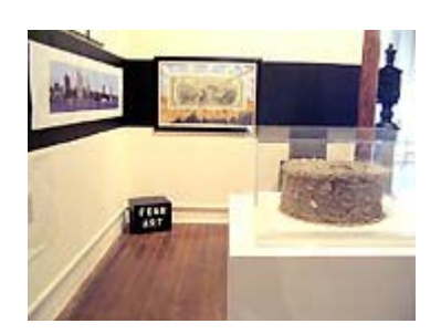
"A Knock at the Door" at the South Street Seaport Museum Melville Museum, New York