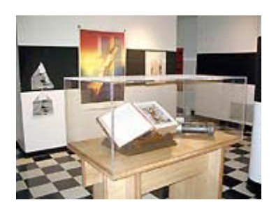
Installation view of "A Knock at the Door" at Cooper Union in New York