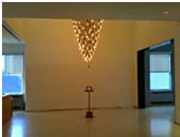
Installation view of Rafael Lozano-Hemmer's Pulse Spiral (2008) at Haunch of Venison, New York