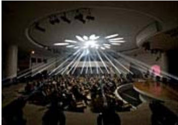
Rafael Lozano-Hemmer's Levels of Nothingness at the Guggenheim