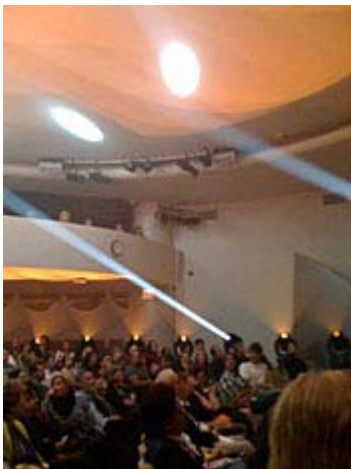
The crowd during Levels of Nothingness