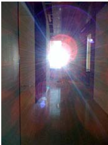
Installation view of prototype for Rafael Lozano-Hemmer's Voz Alta , at Haunch of Venison, New York