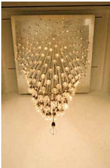
Rafael Lozano-Hemmer Pulse Spiral 2008 Haunch of Venison