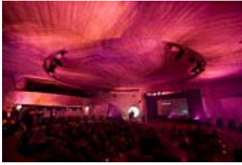
Rafael Lozano-Hemmer's Levels of Nothingness at the Guggenheim