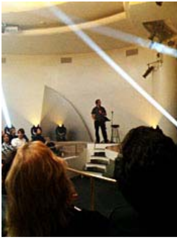
The artist Rafael Lozano-Hemmer introducing Levels of Nothingness at the Guggenheim, Sept. 21, 2009