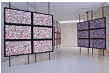
Installation view of Make Out, Plasma Version (2009) at Haunch of Venison, New York