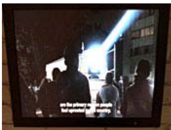
Still from video about Rafael Lozano-Hemmer's Voz Alta