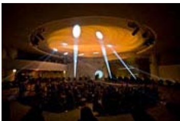
Rafael Lozano-Hemmer's Levels of Nothingness at the Guggenheim

the Guggenheim. "If that is true, I am in the moderate wing of the radical empiricists." In that statement, you have his art in a nutshell -- enthusiastic about exploring the frontier of technological razzle-dazzle, which makes possible a level of collective experience beyond the traditional mode of art-making, and as a result also makes individual creative vision the appendage of a much larger apparatus. But then drawing back just a little, lest this enthusiasm carry us too far from what makes art recognizably human.