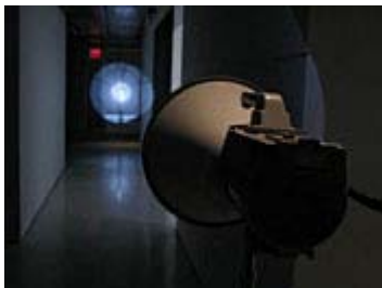
Installation view of prototype for Rafael Lozano-Hemmer's Voz Alta , at Haunch of Venison, New York