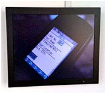
Still from video about Rafael Lozano-Hemmer's Amodal Suspension