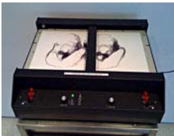
Rafael Lozano-Hemmer Seismoscope 1: Francisco Sanches. Portugese (1550-1632), author of "That Nothing is Known" 2009 Haunch of Venison