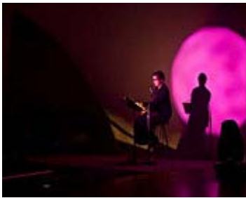
Actress Isabella Rossellini performing in Levels of Nothingness at the Guggenheim