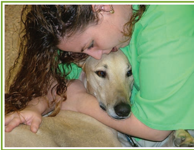
Female inmate with her Greyhound