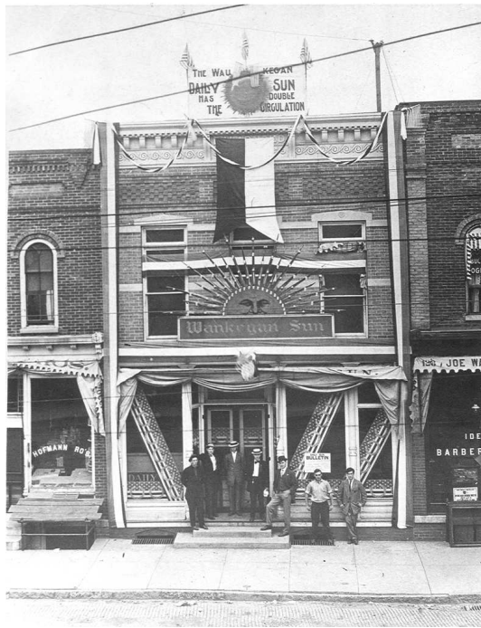
The Waukegan Sun Building North Genesee Street. East side between Washington and Madison Streets.