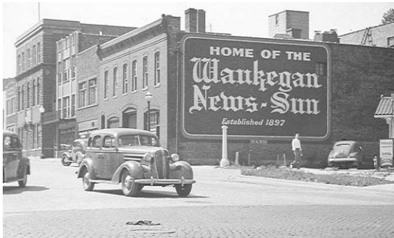
The Waukegan News-Sun Building North side of Madison between Genesee and Sheridan Streets.