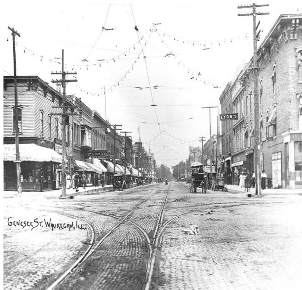
Genesee Street looking north from Washington Street. Waukegan Sun Building was on the right in the distance.