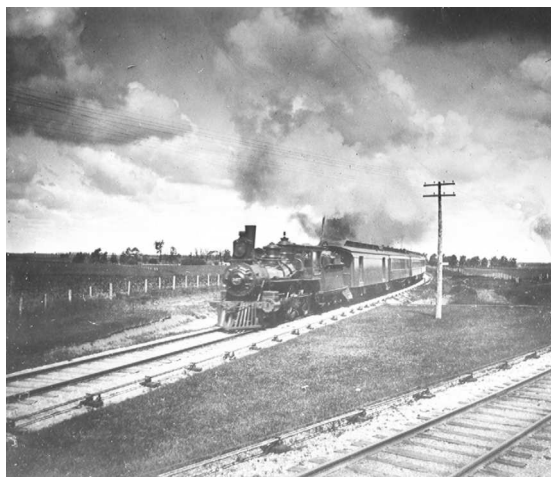
Train arriving in Waukegan 1870s.