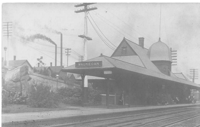
C & NW Depot in Waukegan, c. 1915.