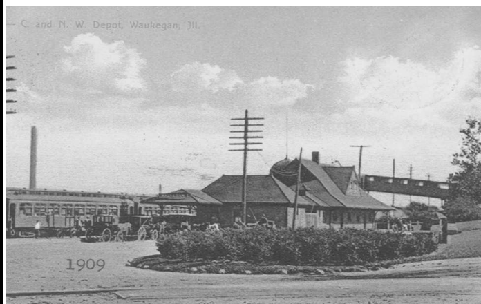
C & NW Depot in Waukegan, 1909.