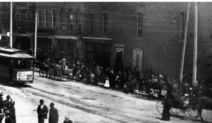
Image of downtown Waukegan from our glass-negative scanning project.

membership in upcoming newsletters. Suffice it to say that we look upon this anniversary as an important milestone and wish to share our enthusiasm with our members and friends.