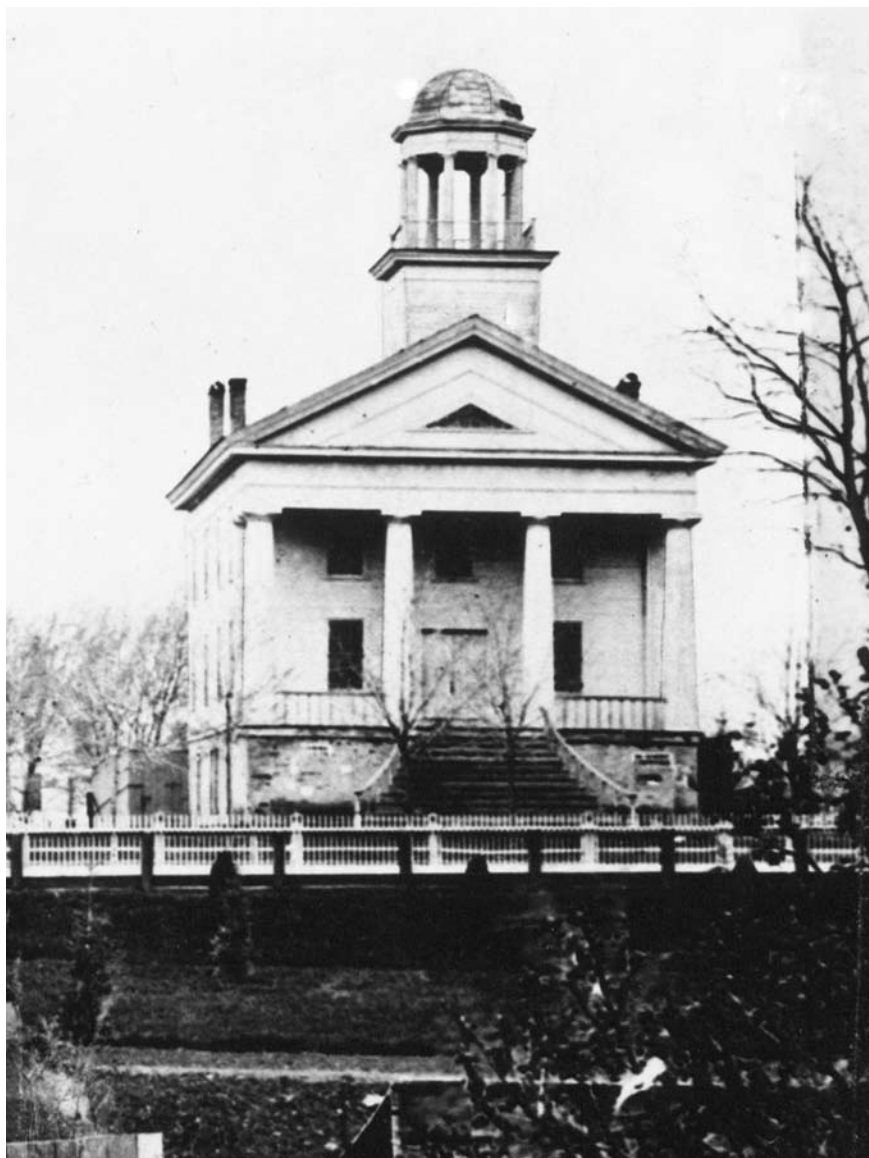
County Courthouse, 1845. See article on page 6.