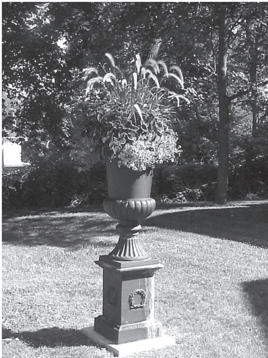
A new urn graces the front of the museum. See page 4.