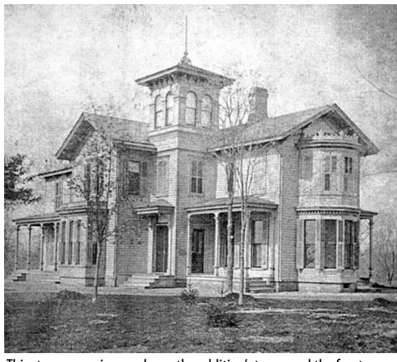
This stereoscope image shows the addition's tower and the front door. The new front door remains today with a slightly different front porch, but the tower was removed at an unknown date.