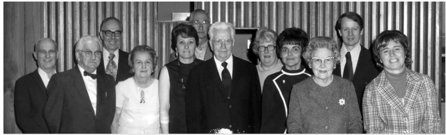
The WHS board celebrates the fifth anniversary of the society in 1973.