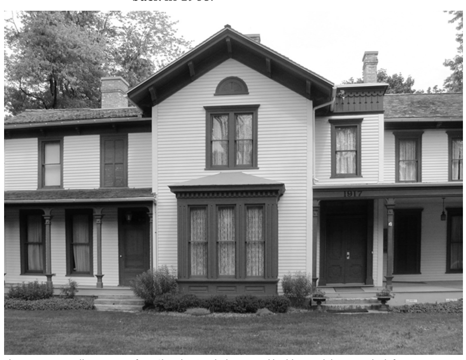
The museum in Fall 2007; view from Sheridan Road. The original building and door is to the left.

I find it surprising that many first-time museum visitors say that they have often driven by on Sheridan Road but never actually set foot in the building. These are often long-time residents of Waukegan who never even knew we were there. After having seen the Museum, they compliment us on the period rooms and exhibits. The beautiful Museum that pleases visitors today had very humble beginnings back in 1968.