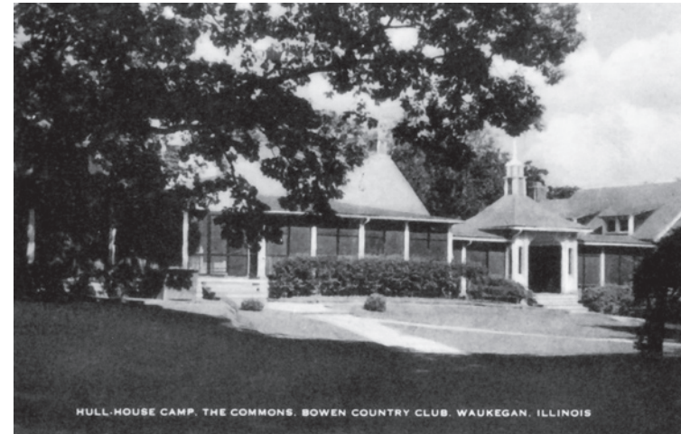
HULL HOUSE CAMP. THE COMMONS. BOWEN COUNTRY CLUB. WAUKEGAN, ILLINOIS

Please contact the Waukegan History Museum to schedule a tour.