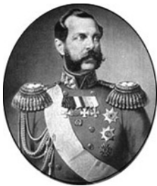
Grand Duke Alexis

After the hunt Alexis went to Denver and had another buffalo excursion. He then toured other cities before leaving for home from Pensacola, FL on February 22.