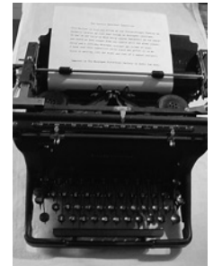
Typewriter from Greiss-Pfleger Tannery