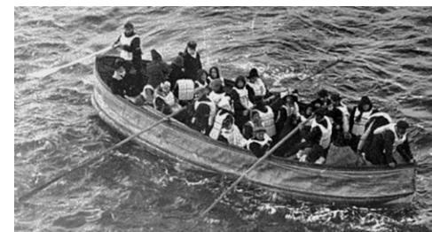
Last lifeboat filled with Titanic survivors. Photo taken by a passenger of the Carpathia , the ship that received the Titanic 's distress signal and came to rescue the survivors. 15 April 1912

The whole world held their breath with anticipation for the latest news on the disaster of the R.M.S. Titanic . People in Waukegan read the latest reports in the newspapers and some waited to hear from their loved ones who were aboard the supposed "unsinkable" ship. Learn more about the local reporting of the sinking as well as local passengers and their fates.