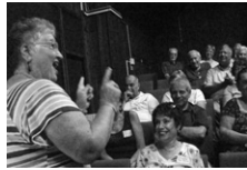
Former Bowen Country Club campers singing old camp songs in Goodfellow Hall (today's Schornick Theatre in the Jack Benny Center).

If you want to know more about what is happening at the Waukegan History Museum, like us on Facebook. If you want to know more about the history related events occurring throughout Lake and McHenry counties like "Northeast Historical Happenings" on Facebook.