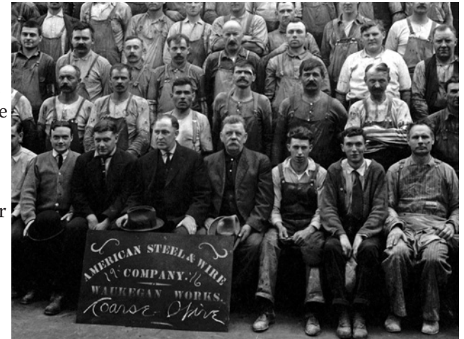
American Steel & Wire Company workers— “coarse wire”

Today barbed wire is still used throughout the west for the same purposes it was used over a century ago. A small museum in La Crosse, Kansas is dedicated to barbed wire. Examples of hundreds of types of wire are displayed along with the tools necessary for manufacturing and installation. It gives a good understanding of the importance of this simple item in our history.