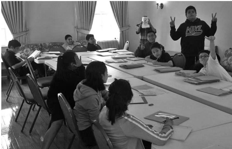
Lyon Magnet School Students research their history projects this Spring.