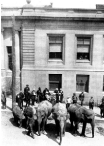
Elephants assemble in front of Carnegie Library