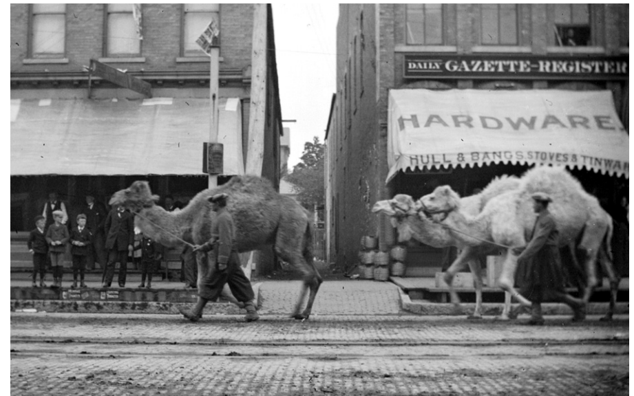
Camels in downtown Waukegan

Early performances were held at the old fair grounds near Jackson and Washington Streets. As the city expanded the circus location moved steadily westward. In 1938, Tom Mix appeared at Green Bay Road and Washington Street. Room was needed to hold all the performers and attendees. Sells-Sterling claimed their tent could hold 7,500 guests. Obviously a tent of that size would take a long time to set up and take down.