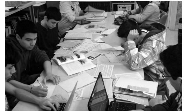
Waukegan High School students working in the Society's Raymond Research Library