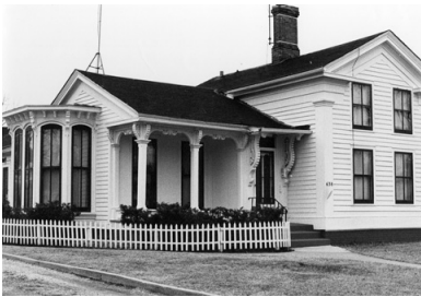
638 N. Genesee Street