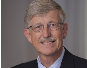
FRANCISS. COLLINS Francis S. Collins, M.D., Ph.D. is the Director of the National Institutes of Health (NIH). In this role he oversees the work of the world's largest supporter of biomedical research. A physician-geneticist noted for his landmark discoveries of disease genes and his leadership of the international Human Genome Project, Collins served as director of the National Human Genome Research Institute (NHGRI) at the NIH from 1993-2008. He was awarded the Presidential Medal of Freedom in November 2007 and the National Medal of Science in 2009.