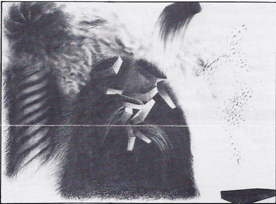
"No. 90" Charcoal and graphite on paper triptych 320.1 x 251.5 cm (126" x 99")