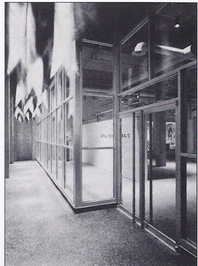
Our new gallery space in the South Granville district, Vancouver, B.C.