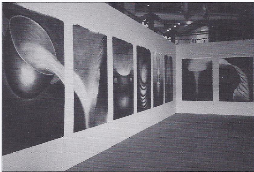
Monique Fouquet, Vessels , installation view