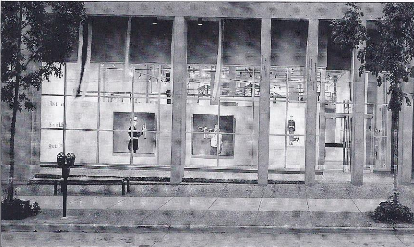
Diane Farris Gallery exterior