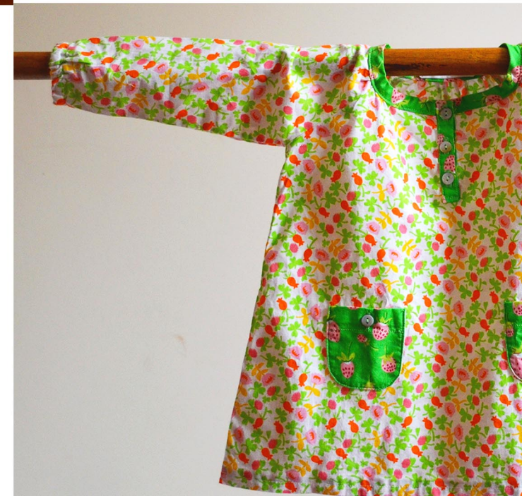
detail: Briar Rose Tunic see back cover for more information