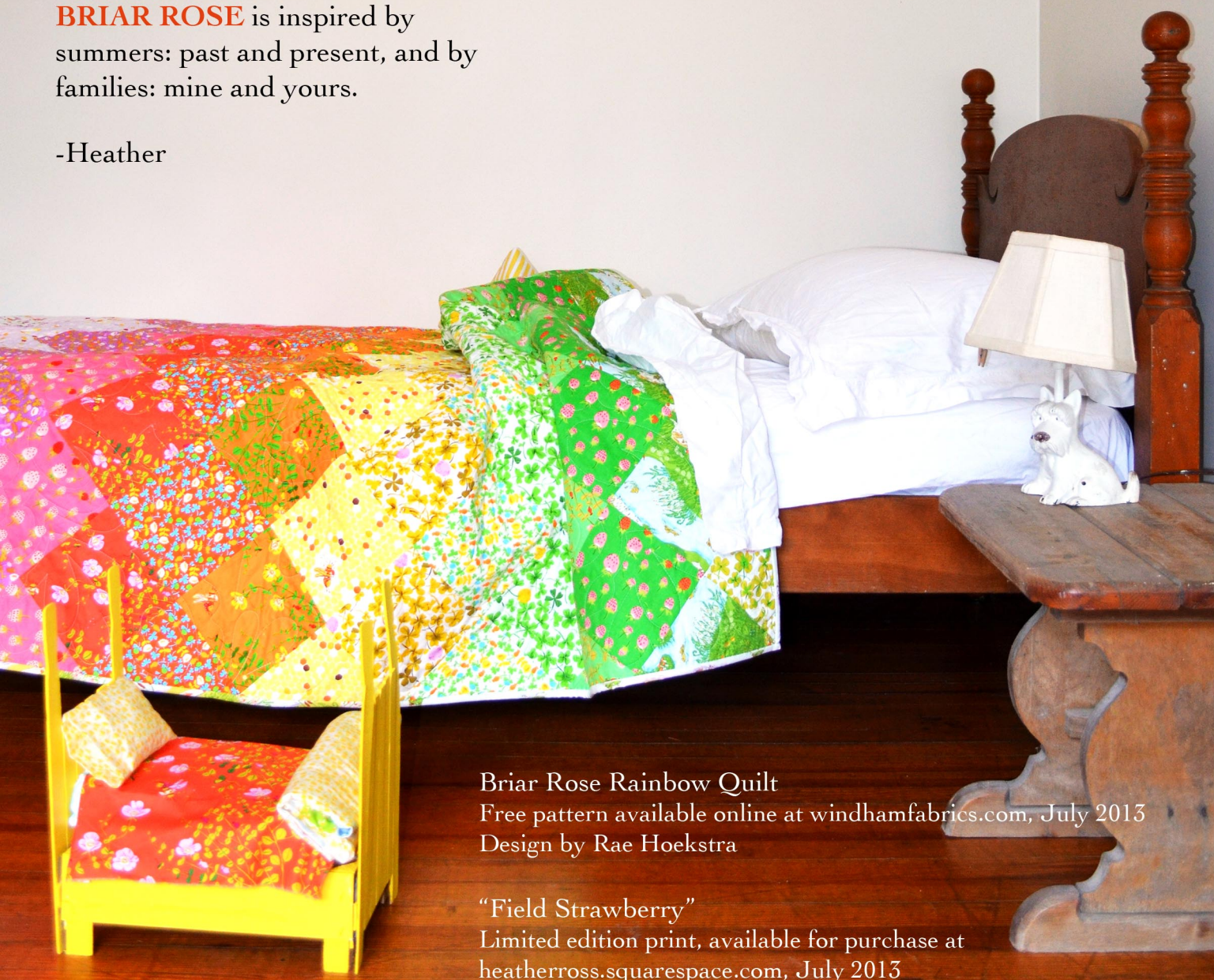
Briar Rose Rainbow Quilt Free pattern available online at windhamfabrics.com , July 2013 Design by Rae Hoekstra