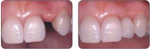
A missing lateral incisor was replaced with an implant and crown.