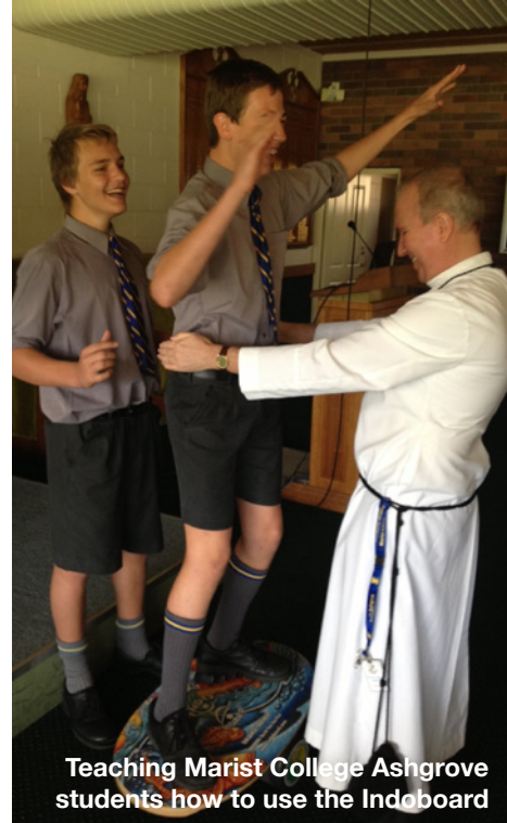
Teaching Marist College Ashgrove students how to use the Indoboard