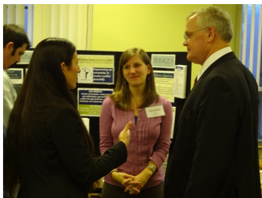
WDRC Open House