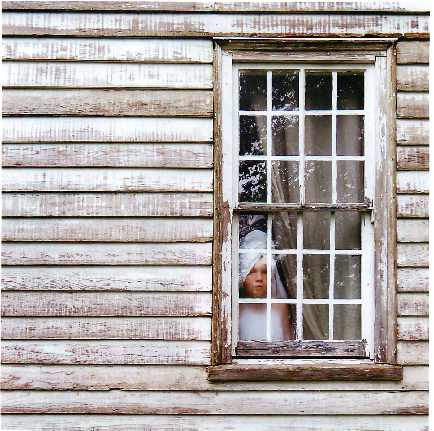
Cig Harvey, The Girl with the White Towel , 2011. Rockport, Maine.