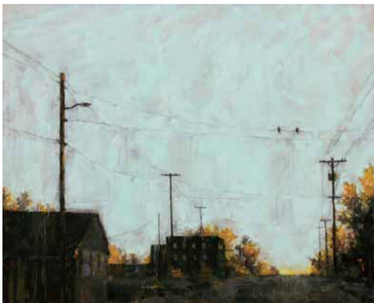
And Maybe We Will , oil on panel, 48 x 60"