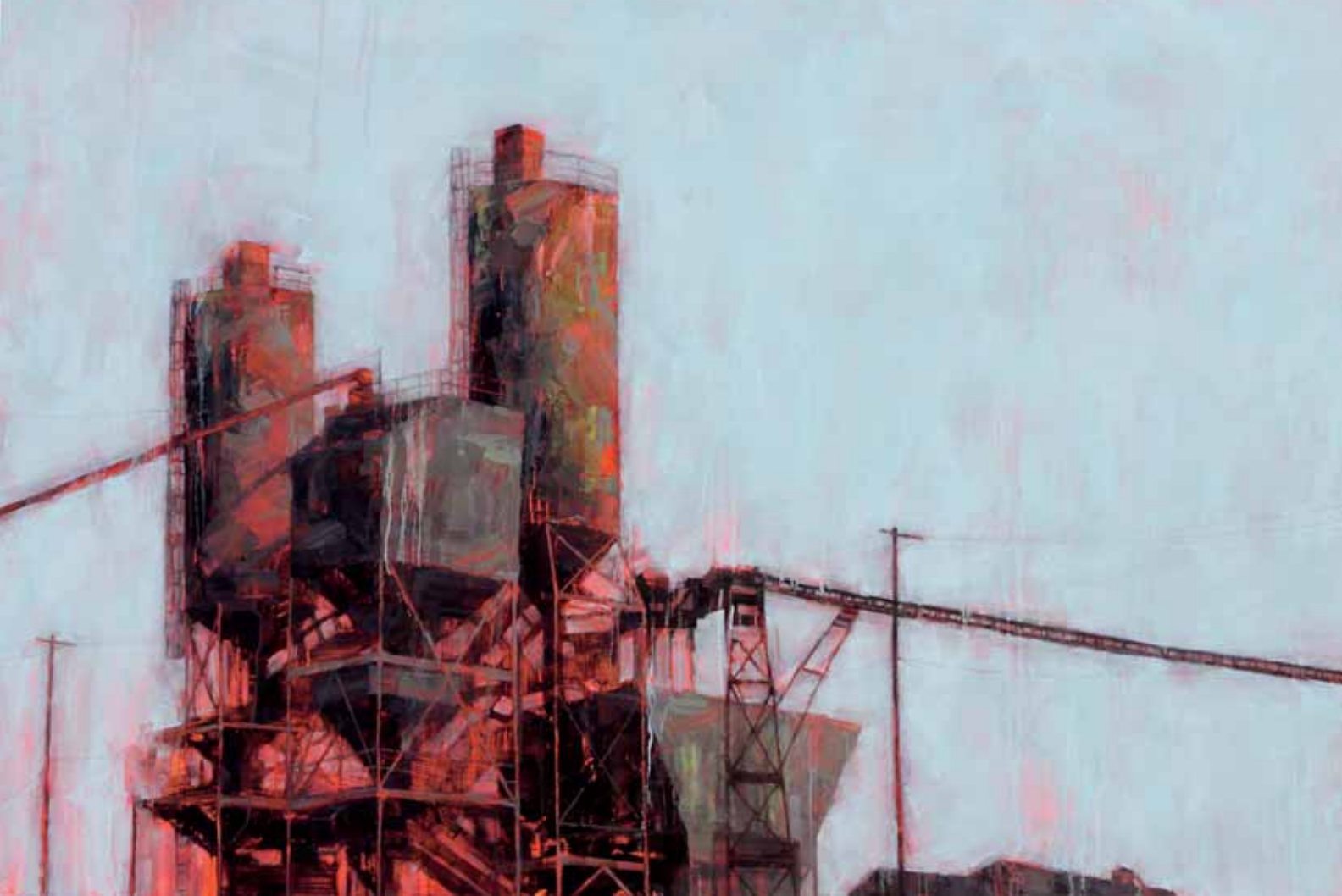
The Lines We Draw , oil on panel, 48 x 72"