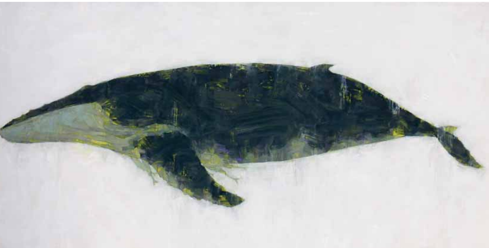
Steadfastly We Waver , oil on panel, 48 x 96"