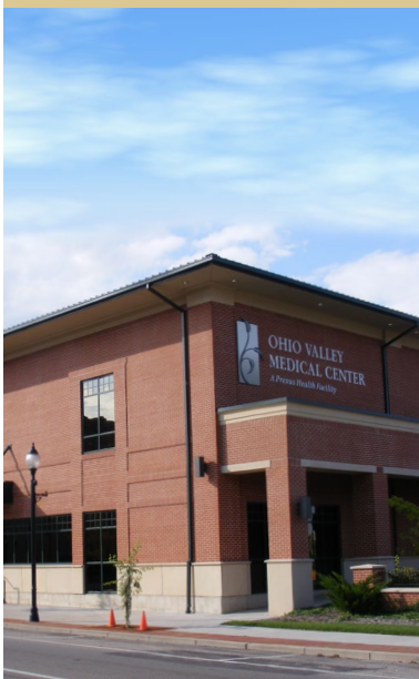
The site for the current Ohio Valley Surgical Center in Springfield was revitalized using Clean Ohio funding.