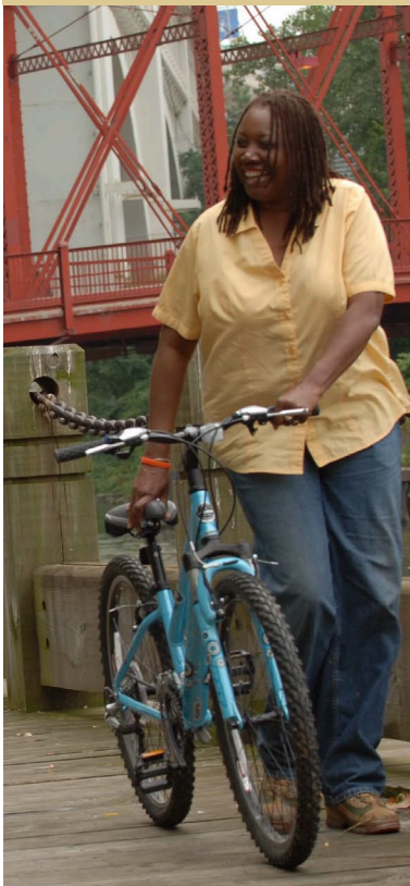
Development of the Ohio & Erie Canal Towpath Trail in Cleveland was supported by Clean Ohio.