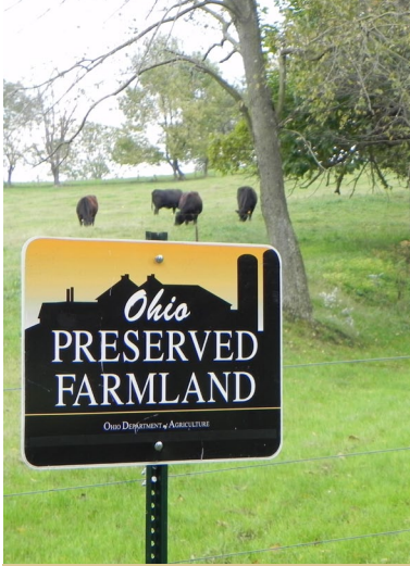
Smith Farm, located in Fairfield County, was preserved with a Clean Ohio agricultural easement.

An Investment In Economic Revitalization, Family Farms & Environmental Health