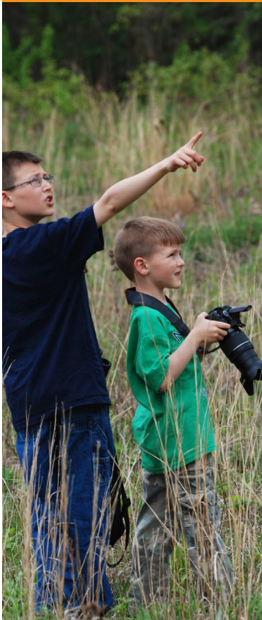
The Nature Conservancy's Kitty Todd Nature Preserve in Northwest Ohio is supported in part by Clean Ohio funding.