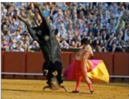
continued on page 2