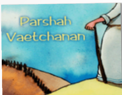
THIS WEEK'S PARSHA