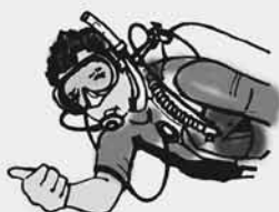
Go that way.