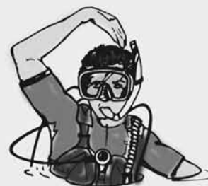
OK? OK! (one hand occupied)