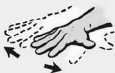
Level off; this depth