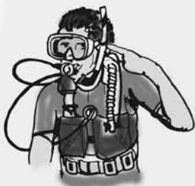
Ears not clearing.