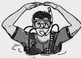
OK? OK! (on surface at distance)