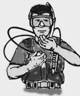
Buddy breathe or share air