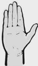
Stop; hold it; stay there.

These are standard scuba hand signals that are useful both above and below the surface. You will learn these as part of your Scuba BSA experience. Hand signals used with express permission of International PADI, Inc. © International PADI, Inc.