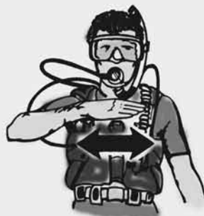
Out of air!