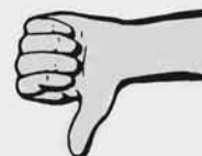
Go down; going down