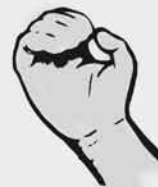
OK? OK! (glove on)