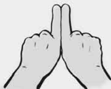
Get with your buddy.