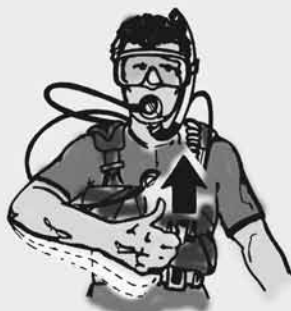
Go up; going up