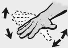
Something is wrong.