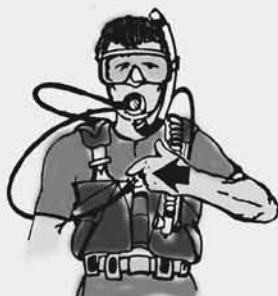
Me or watch me.