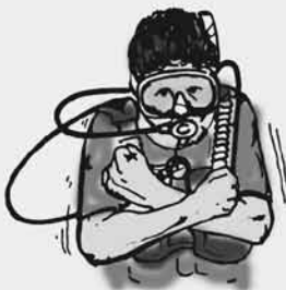
I am cold.