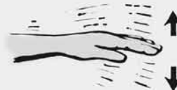
Take it easy; slow down.