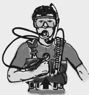
Low on air!