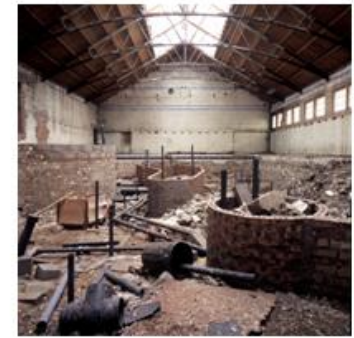
The interior of the Baths as existing Glasgow City Council is developing proposals for a new Leisure Centre which will include swimming and indoor sports

of the attractive stone street facades of the existing buildings, including the Halls building that was built in 1878. The buildings are "Listed" for their architectural and historic importance. In addition to careful conservation work, it is proposed that new dynamically designed buildings constructed of modern materials will add value and give a new dimension to the best from the past. The whole project will be designed to be environmentally friendly, long lasting and will incorporate a series of energy conservation measures.