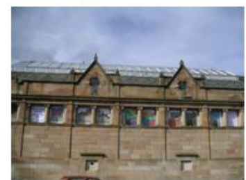
Artwork for Doors Open Day 2004 by local young people

Designs for the project are currently being worked up and will be on display shortly for public view and feedback.