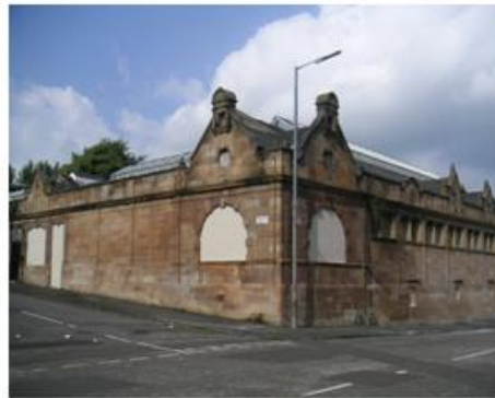
Maryhill Swimming Baths at the corner of Gairbraid Ave and Burnhouse St

The proposal includes swimming and dry sports facilities on the site of the old Swimming Baths in Garbraid Ave-