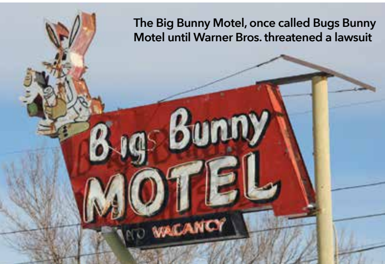
The Big Bunny Motel, once called Bugs Bunny Motel until Warner Bros. threatened a lawsuit