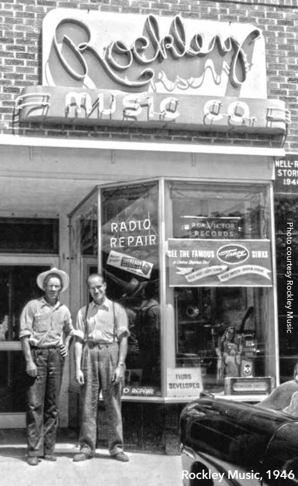
Rockley Music, 1946