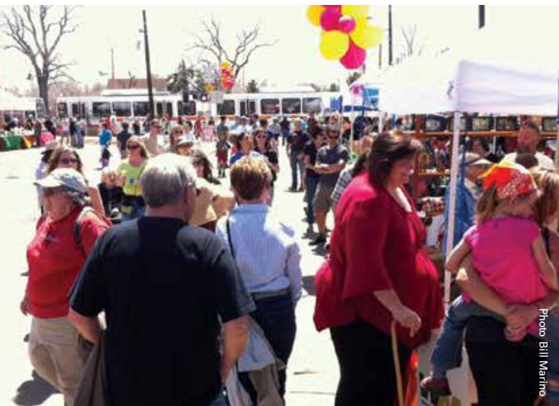
Pop-up arts festival during the opening of the W Line

new creative energy to the corridor—a harbinger of good things to come.