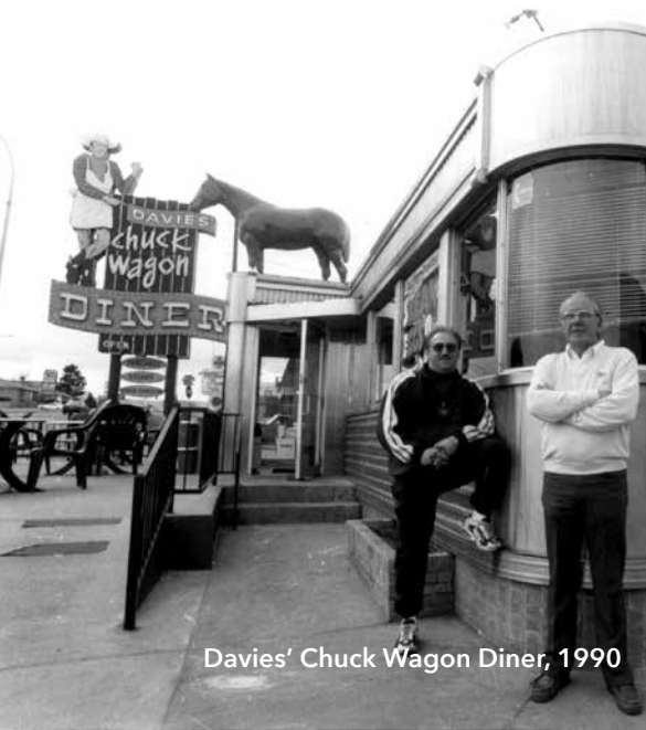
Davies' Chuck Wagon Diner, 1990