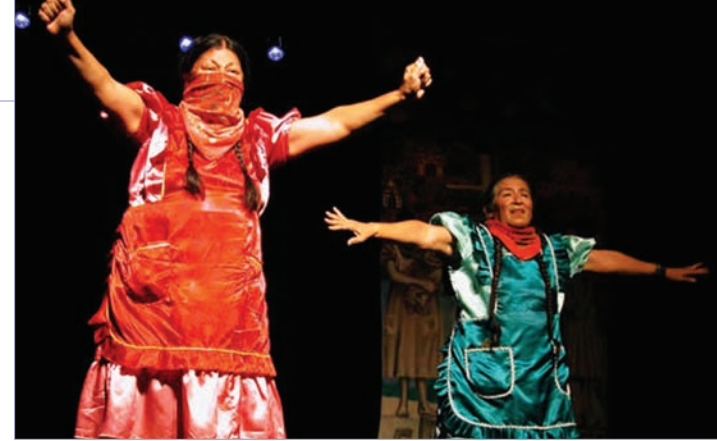
Coalitue Theater Company

The Global Weekends series is free with suggested Museum admission. Neither tickets nor reservations are required. Seating is limited and is on a first-come, first-served basis.