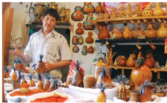
Spices of Bukhara

Concert with the Voices of the Silk Road singers and musicians 4:00 pm • Kaufmann Theater, first floor