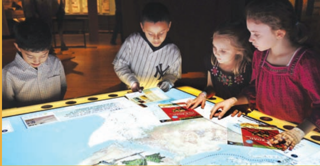
Children with electronic interactive map of the Silk Road

Traveling the Silk Road: Ancient Pathway to the Modern World Through August 15