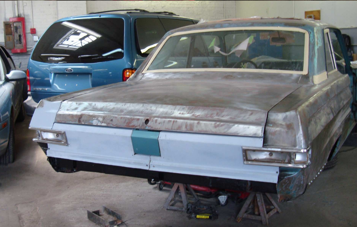
Align with adjacent panels