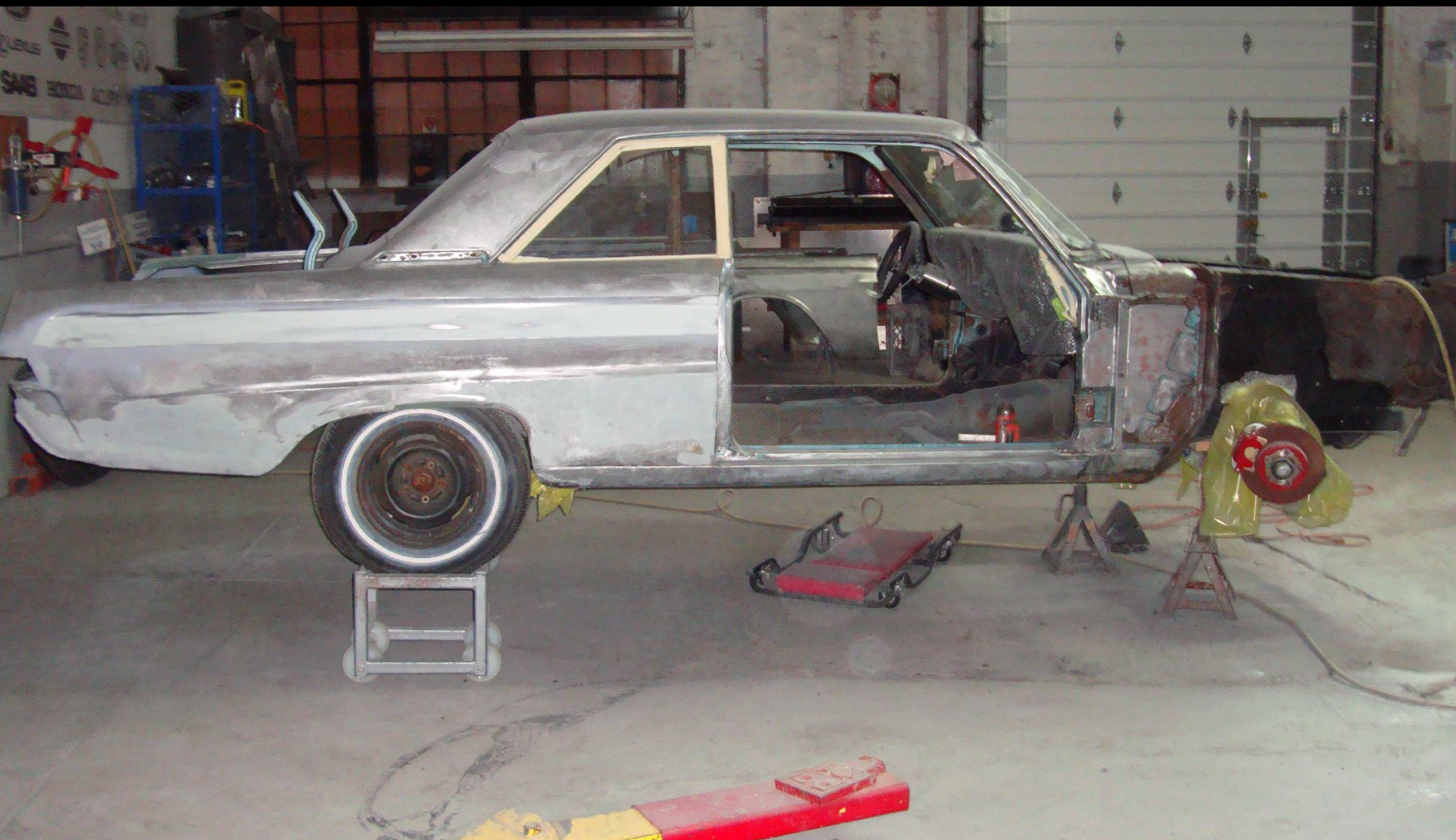
Disassemble and prep for epoxy primer