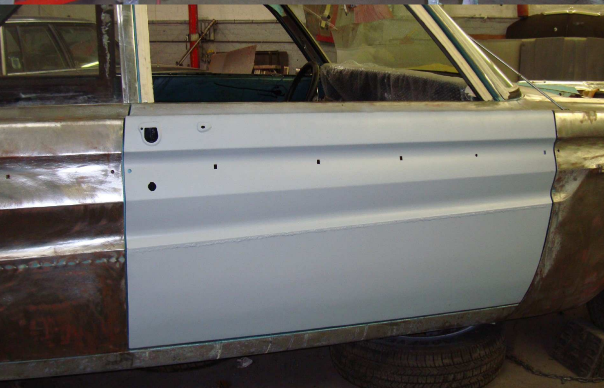
Door skin panel welded in, smoothed, and primed