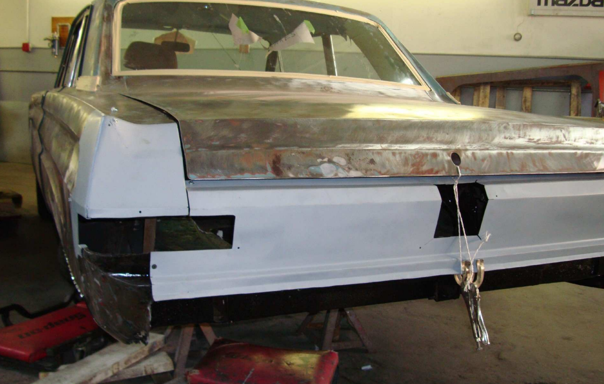
Test fit panels