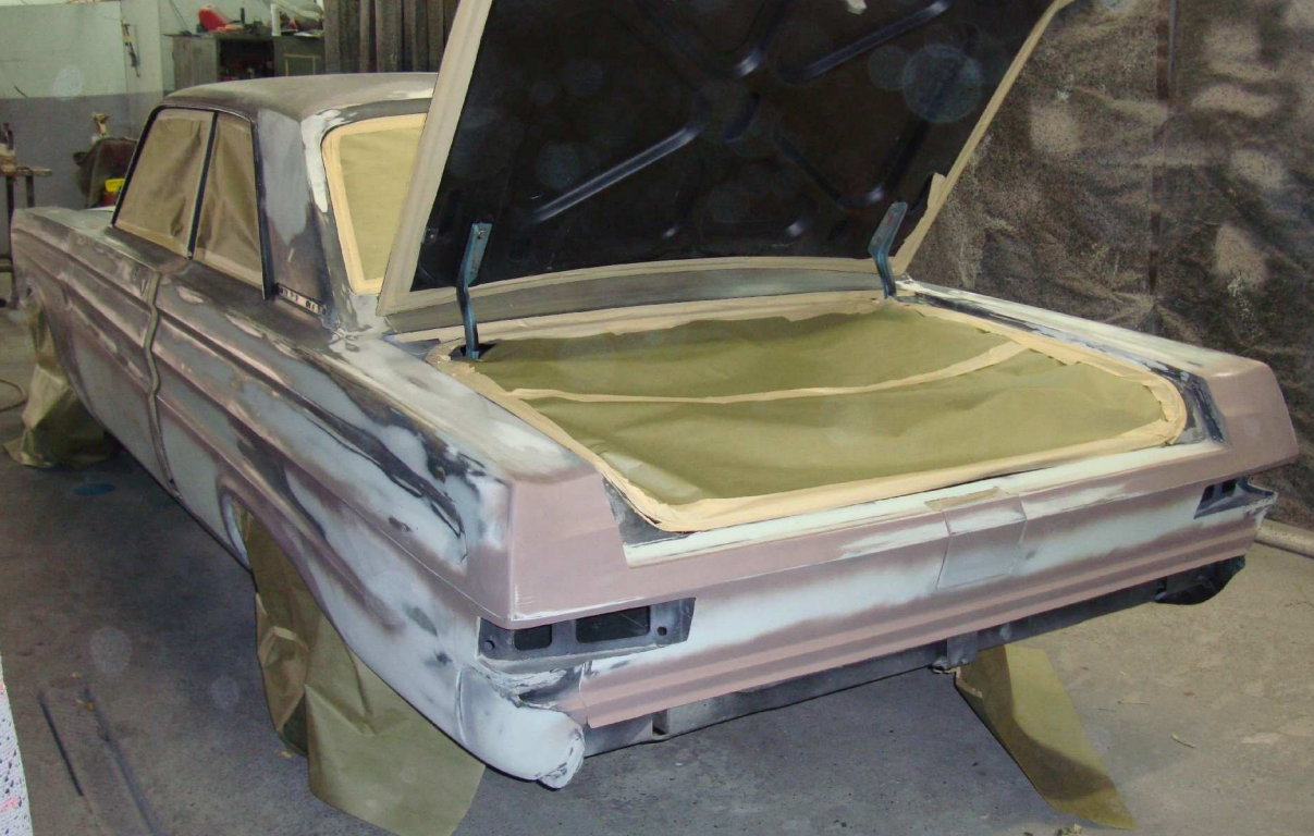
Mask off vehicle