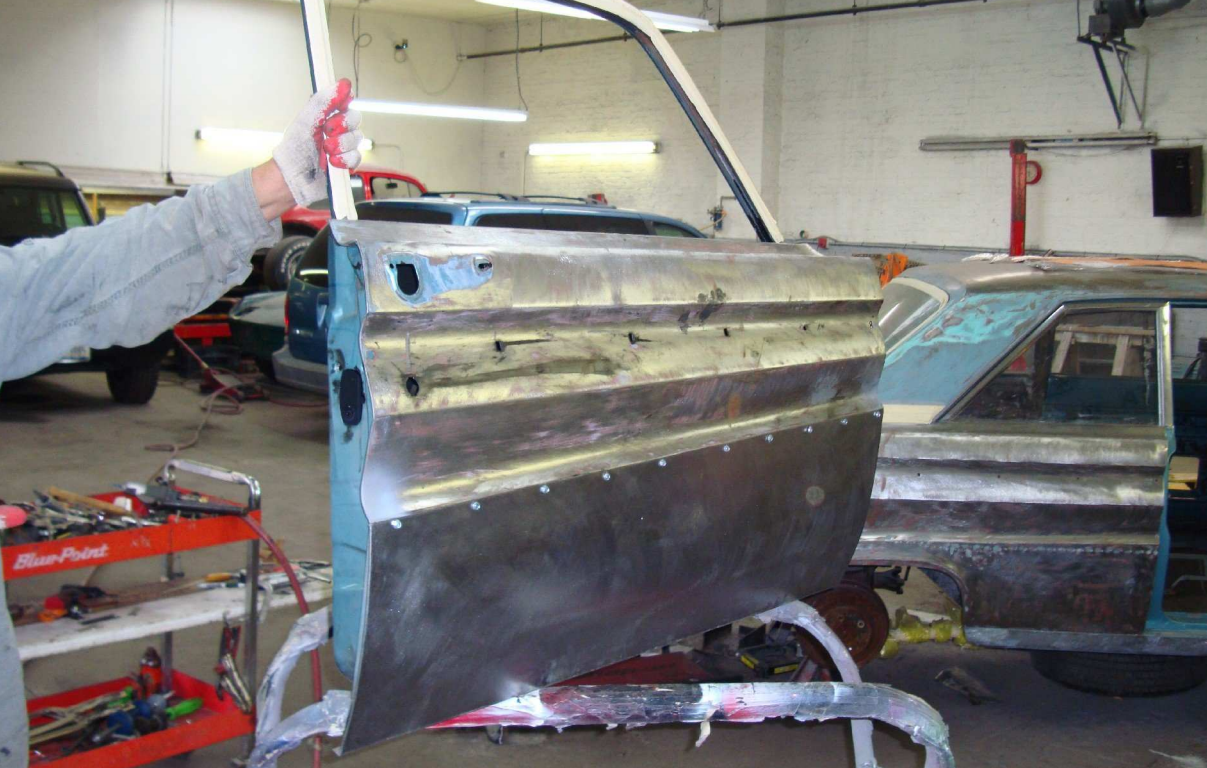
Test fit newly fabricated panel