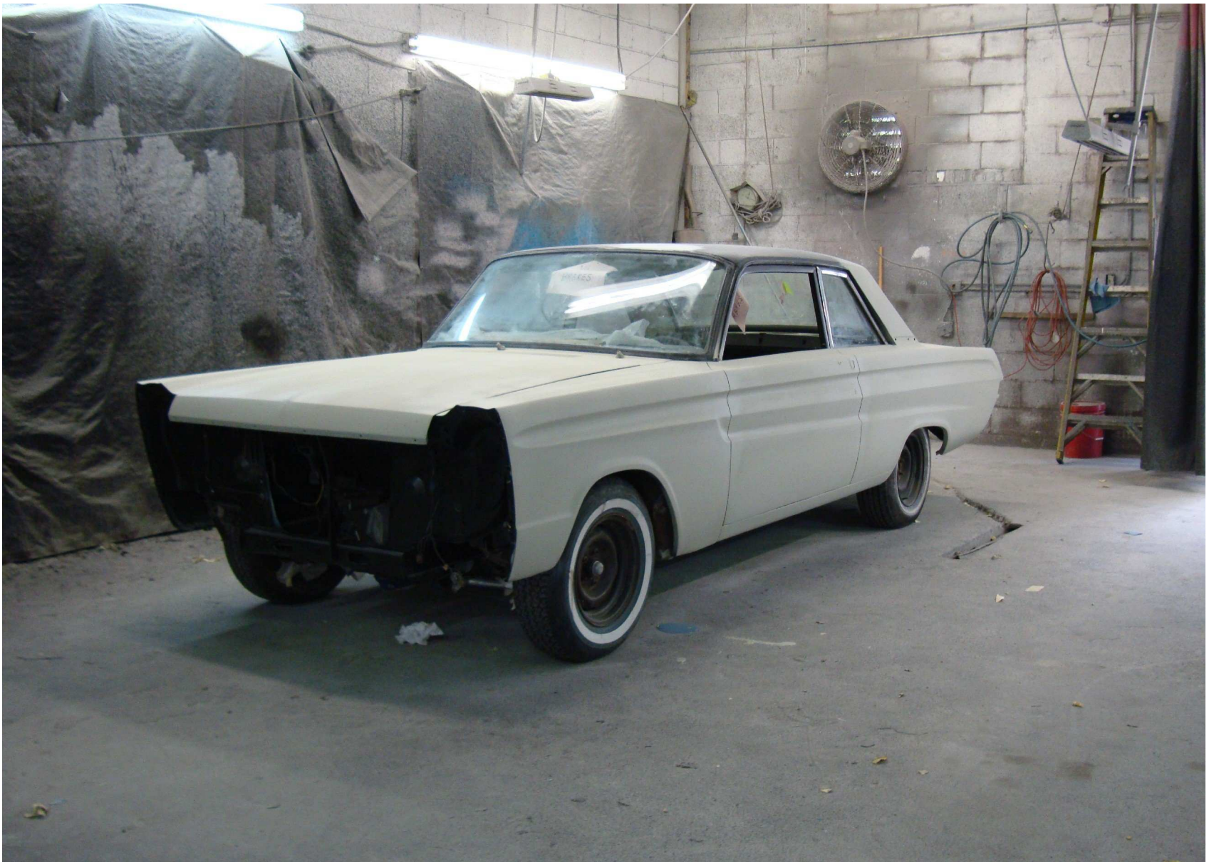
Filler primer applied to entire vehicle body