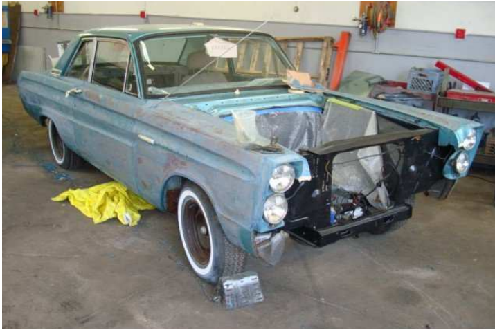
Original paint being removed via chemical stripper