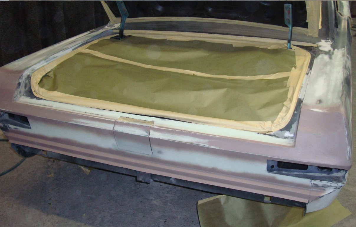
Prep for filler primer