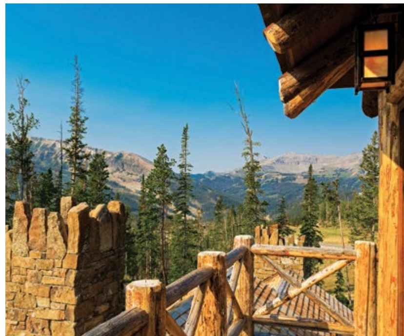
CLOCKWISE (from bottom left): The owners wanted their mountain retreat to include a tower for enjoying the Big Sky scenery, and, according to architect Matt Faure, "the tower became the heart of the home and the organizing element for everything else." Inside its third-story lookout at the top of a winding staircase, a cozy sitting area is furnished with six hair-on-hide pub chairs. The homeowner notes that, from the widow's walk encircling the tower's top story, "The views are incredible. We have a 360-degree vista encompassing Lone Mountain, Cedar Mountain, Pioneer Mountain, and the Gallatin Range."