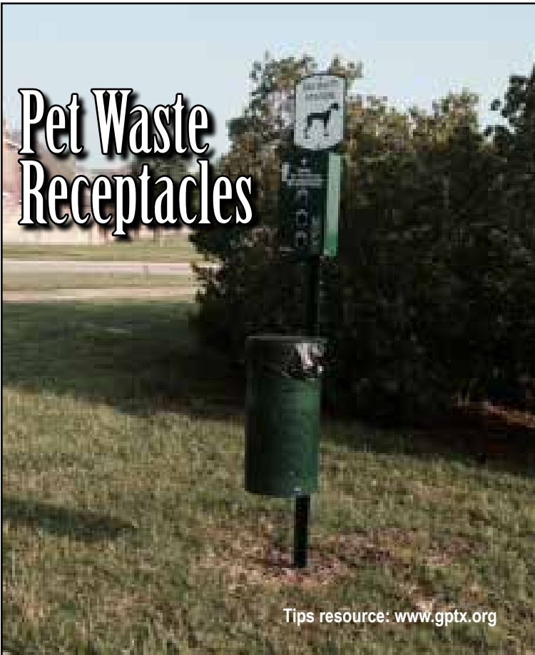
Tips resource: www.gptx.org

Pet waste is a health hazard and water pollutant. To help responsible pet-owners in our community, pet waste disposal cans have been installed in high traffic walking areas for your convenience. It's easy to protect our drinking water and keep our green spaces beautiful and safe for all residents, by knowing a few things: