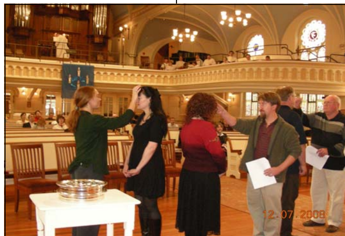
Welcoming Catechumens and Affirmers at the 11:00 a.m. worship on the Second Sunday of Advent.