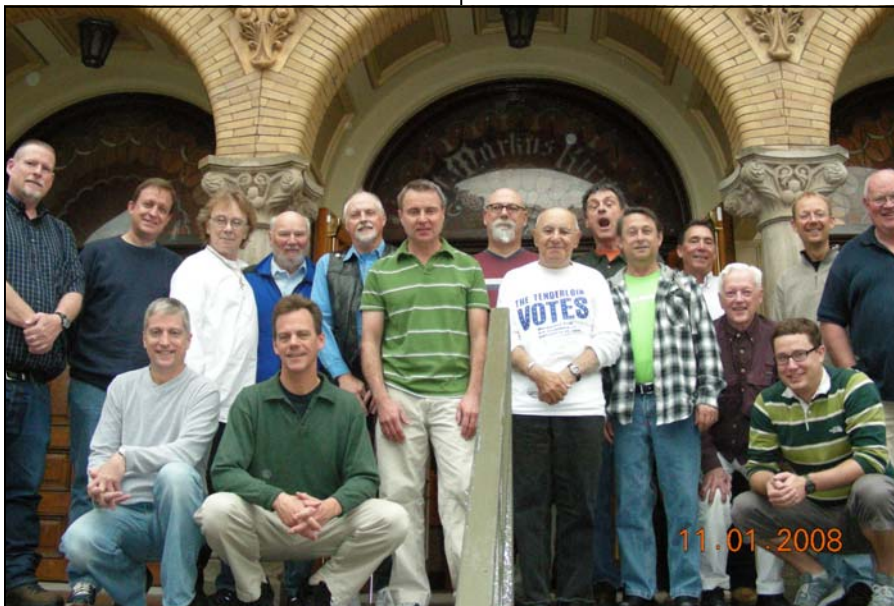
The Nov. 1, 2008 St. Mark's Men's Retreat group pose in front of the church.