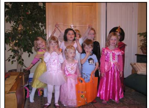
St. Mark's kids display their Halloween best at the Parents with Kidlettes party on Oct. 30, 2008.

Eucharist and imposition of ashes will be offered at 12:00 noon and 7:00 pm