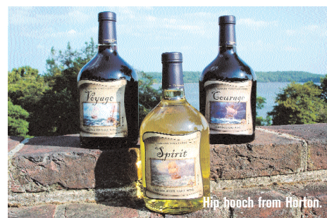
Hip hooch from Horton.