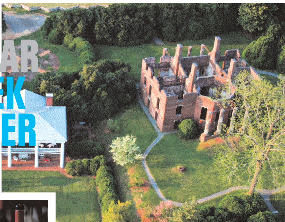
TIMELESS TERROIR: Ruins of the Thomas Jefferson-designed Barboursville mansion rest beside The 1804 Inn. The winery's Octagon vintage is prized.