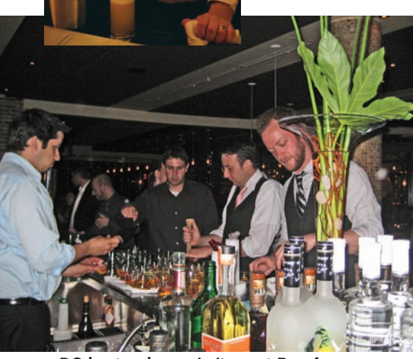
DC bartenders mix it up at Proof.