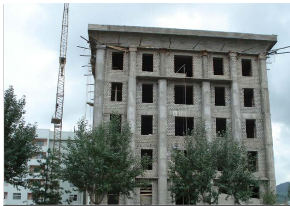
Construction on the Rajin branch of Golden Triangle Bank